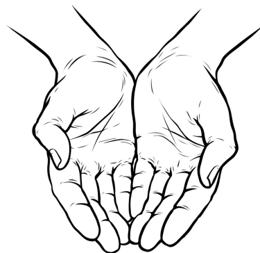
Quality of care