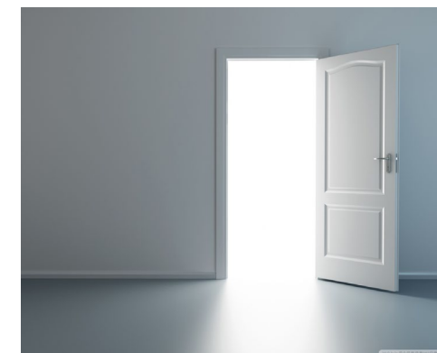
Access to care